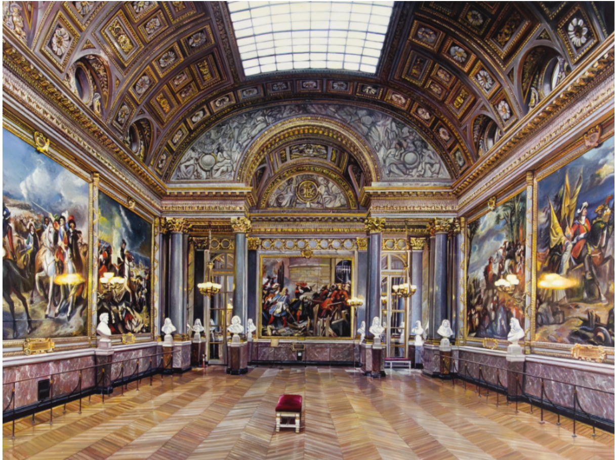
ARENA • 2019 • Oil on canvas • 120 x 160 cm