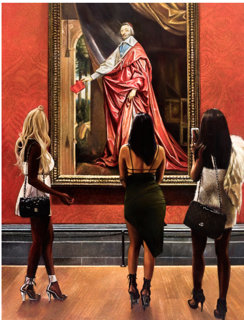
MODERN TIMES • 2021 • Oil on canvas • 130 x 100 cm • private property