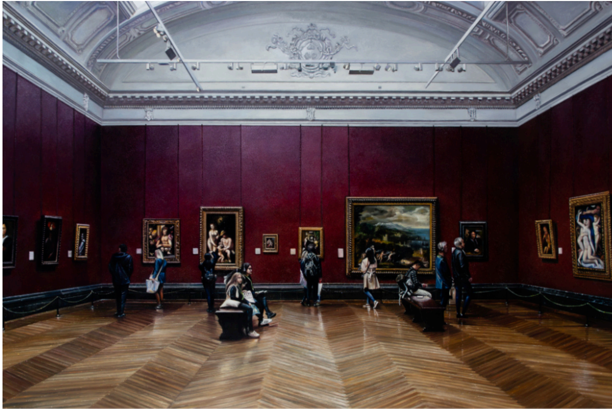
A SPACE STUDY • 2022 • oil on canvas • 130 x 195 cm • private property