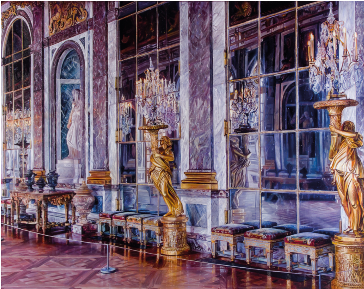
THE MIRROR HALL II • 2019 • Oil on canvas • 120 x 150 cm