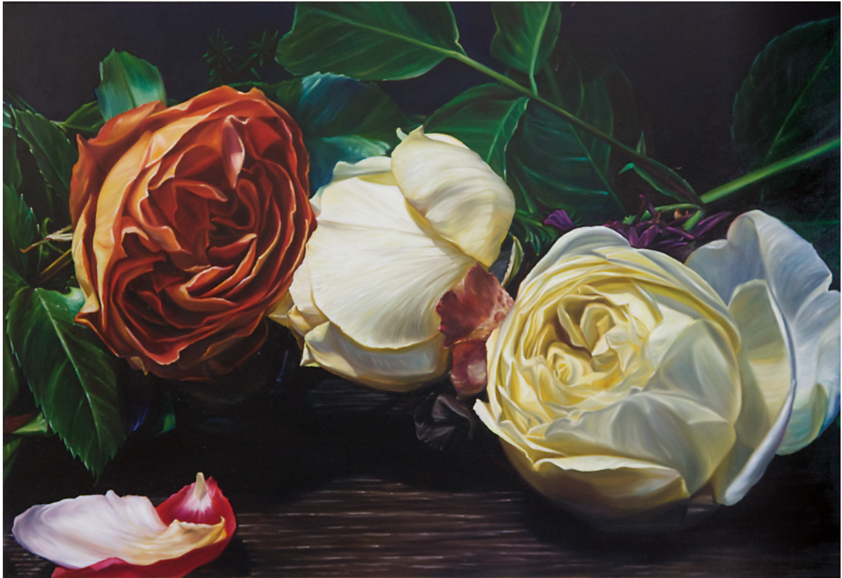
FOR YOU • 2013 • Oil on canvas • 100 x 150 cm